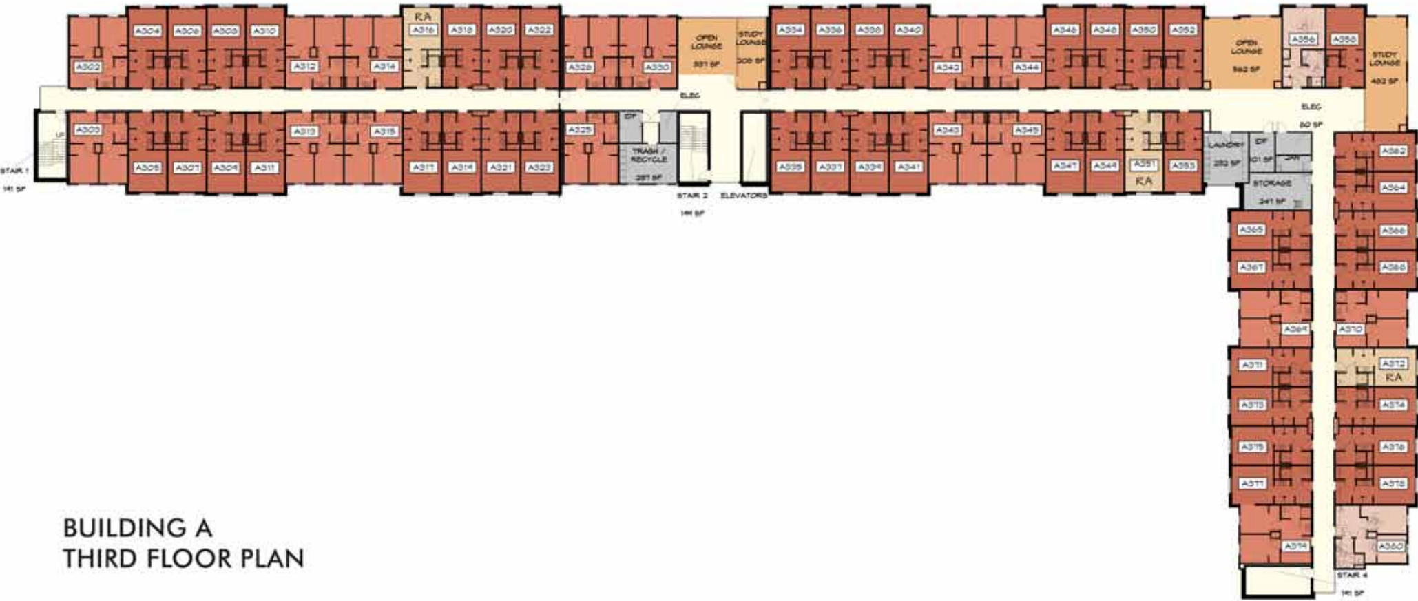
BUILDING A THIRD FLOOR PLAN