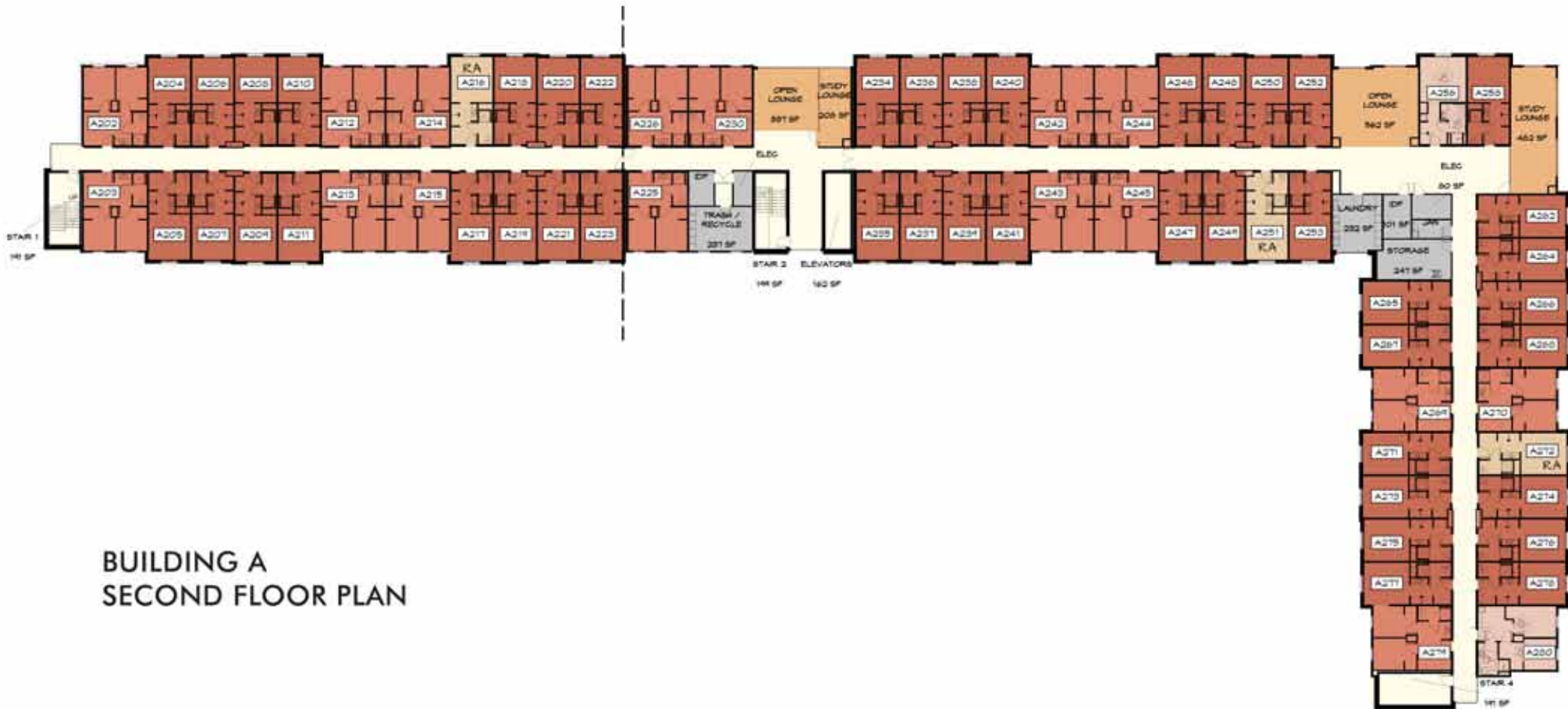
BUILDING A SECOND FLOOR PLAN