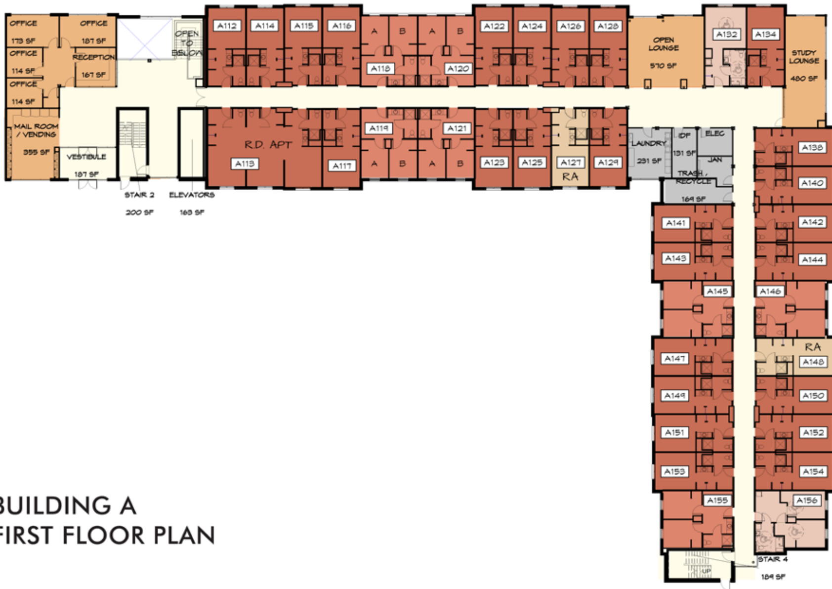
BUILDING A FIRST FLOOR PLAN