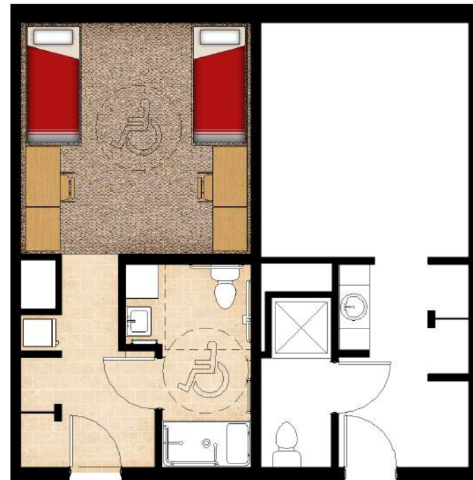
UNIT A - ACCESSIBLE