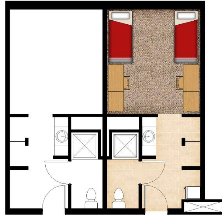
UNIT A - SHARED BEDROOM

11 APRIL 2013 ENLARGED TYPICAL UNIT PLANS