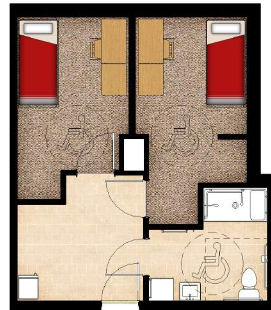
UNIT B - ACCESSIBLE