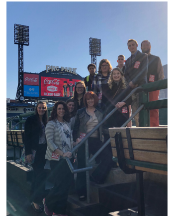
Advertising Club visits the Pirate's field.