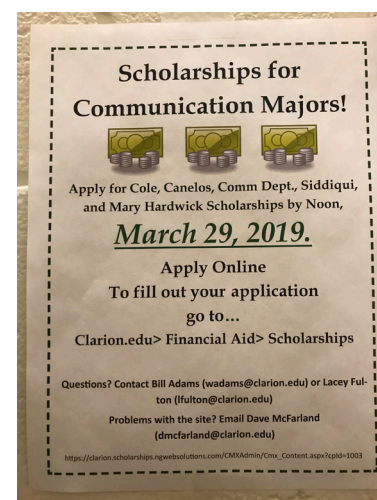
Scholarship announcement posted in Becker.