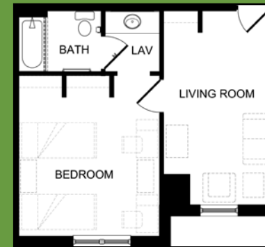
Standard two-person unit