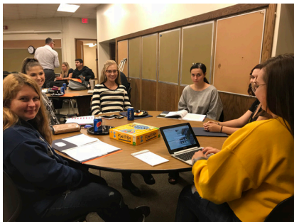
Students at game night

The Peer Mentor Program has hosted three parties for students during this semester. The parties were all based off of themes. Usually the parties coordinated with the upcoming holiday. For example, they hosted a Halloween party that had spooky treats and costumes. The last party that they will host this semester is on December 6th at 7pm and it is the Holiday Party.