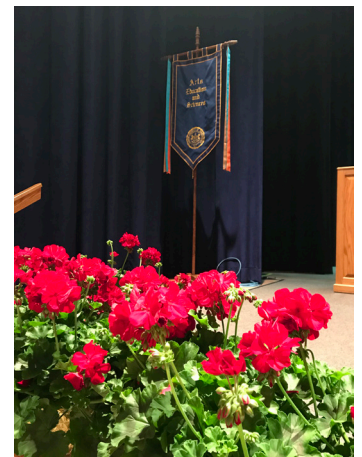
The commencement stage is set.

As the final weeks of the semester end, students and faculty eagerly await their final assignments and graduation day. The end of every semester brings many joys and sorrows as students say goodbye to their undergraduate lives. However, the knowledge and skills distilled in winter graduates by the department will guide them throughout their professional lives.