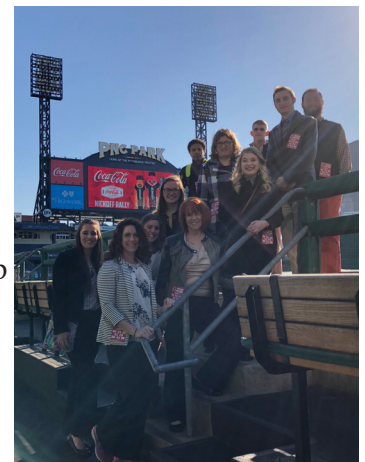
ADFED students at the Pirates

This semester was very busy for communication majors. Students always enjoy participating in the events that the Department of Communication hosts. We hope that the spring semester goes as well as this fall semester did!